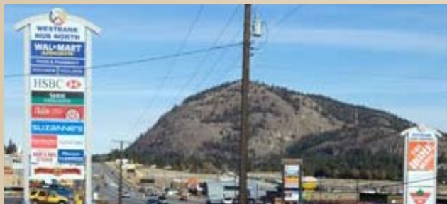
Tsinstikeptum IR9 Commercial Area