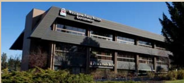
WFN Government Building