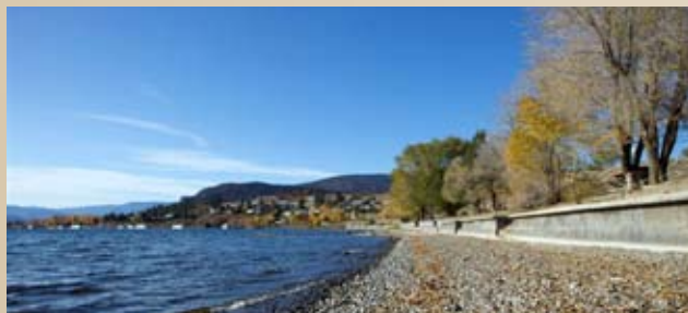
Tsinstikeptum IR9 Beachfront