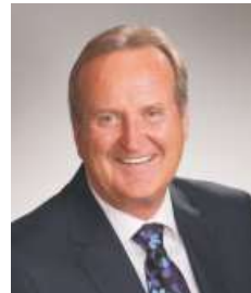
Mayor Stu Wells Mayor of Osoyoos