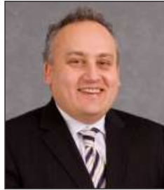
Sector Leader, Kerr Wood Leidal, Facilitator

Kerr Wood Leidal - "Energy Opportunities"