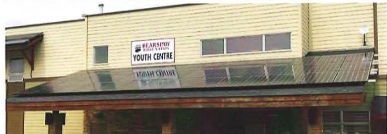
15 kW grid-tied PV - Bears Paw First Nation, AB