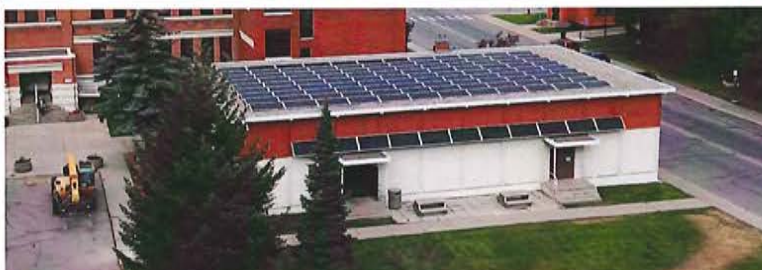
39 kW grid-tied PV - Ktunaxa First Nation, BC