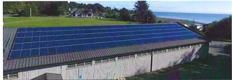
50 kW grid-tied PV - Haida Gwaii First Nation, BC