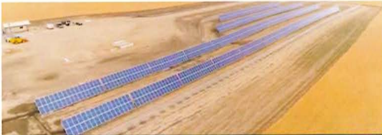
397 kW grid-tied PV - Cowessess First Nation, SK