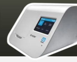
Abbott ID Used as screening device