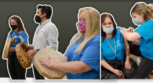
sntxmistr' & traditional medicine