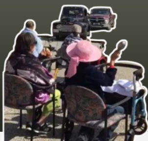
Elders drive by parade thanking staff 28-04-2020