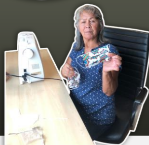
Elders making masks for children at Sensusyusten and community members